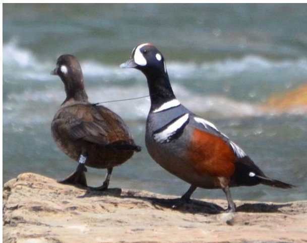
Figure 1: Breeding pair of harlequin ducks ( Histrionicus histrionicus ) on the breeding grounds on Upper McDonald Creek, Glacier National Park, MT, USA.

Harlequin ducks (Fig. 1) are a migratory species with a Holarctic distribution. They winter along northern latitude coastlines and migrate inland to fast-moving streams to breed. Individuals are long lived (an 18-year-old male in the study population is one of the longest lived harlequin ducks on record) and form life-long pair bonds. Annual female survival averages 78%, based on data from two banded populations (Smith, 1998), and female breeding success is generally low until at least 5 years of age (Reichel and Genter, 1996). However, females can breed in their second year (Robertson and Goudie, 1999), and there are two accounts of yearling females breeding. Reproductive deferral is common in this long-lived species (Bengtson and Ulfstrand, 1971). Over 20 years of surveys on this population indicate that, on average, only ~30% of the paired females produce broods (range, 0–100%; W. K. Hansen, unpublished data). Studies on other populations indicate similar low brood production by paired